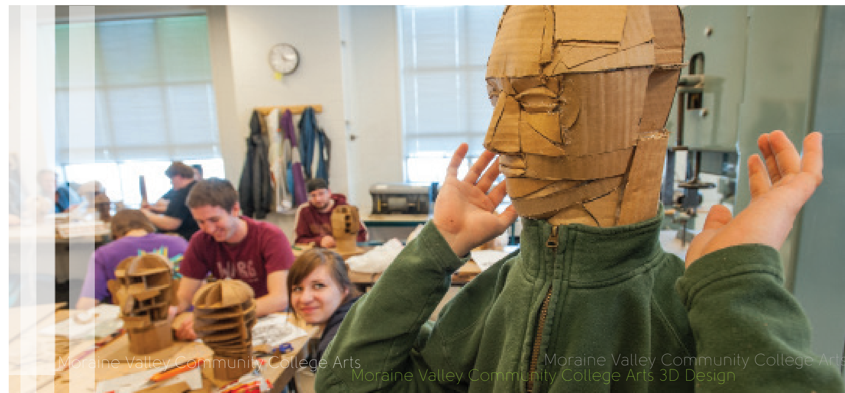
Moraine Valley Community College Arts

Have a desire to create beauty, challenge beliefs, question mediocrity and inspire souls — your own and others.